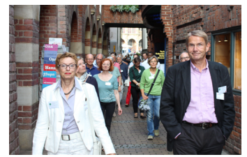
Impressions of the Böttcherstraße.