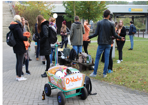
BWL-StugA with a handcart.

On Thursday, an all-time favorite event of the first week at university took place, which is often joined by more advanced students as well: a pub crawl through the Bremen Viertel. Numerous small groups of about twenty people went bar-hopping and enjoyed the city's nightlife. For the first-year students of Communication and Media Studies, an open-air pizza party at the Bremen Roland followed on Fri