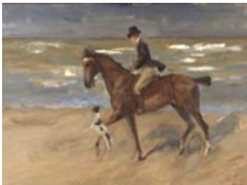
© VG Bild-Kunst, Bonn: Max Liebermann, Reiter am Strand mit Foxterrier, 1911, Öl auf Leinwand, 70 x 100 cm Nationalmuseum Stockholm

Important: The event is already sold out! More information here .