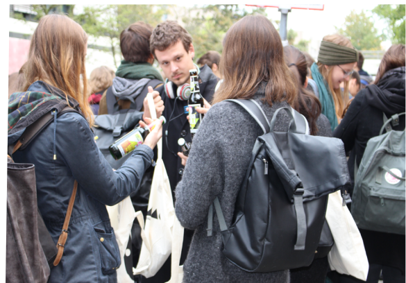
Goodie bags for the first-years.