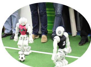
Center for Artificial Intelligence (DFKI). At the invitation of Profes-

On the 20. of September our alumni visited the German Research