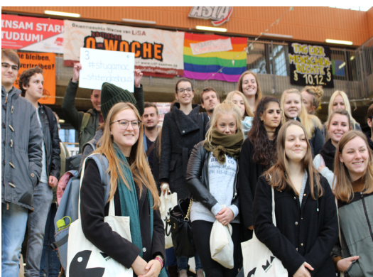
A view new Media and Communication Students in our glass hall.

We wish all newcomers the best for their start into student life! /WB