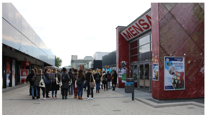
Visiting the canteen of the University of Bremen.