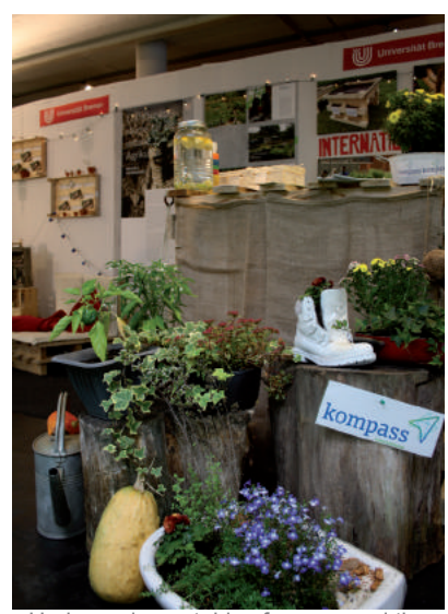
Herbs and vegetables from around the world

nternational Urban Gardening – at the student housing dormitory 'Am Fleet' and 'Spittaler Straße' – is a project that has been implemented in the course of last year by the kompass team of the International Office of the University of Bremen in cooperation with the Studentenwerk and the association Gartenfreunde